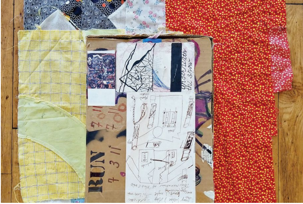
Detail of a kit in the 2016 exhibition "Dressing for God," at Yale Union in Portland, Oregon