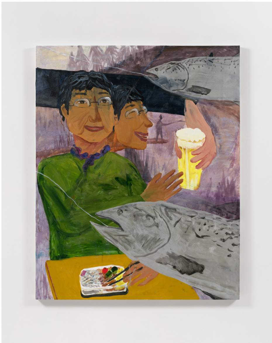
KYOKO IDETSU, Man's Quest , 2022, oil on canvas, 161.93 × 129.86 cm.

Upon entering the gallery, I noticed that portions of the checklist notes were inscribed in English and Japanese onto the walls by a handful of the paintings, including the eponymous I want to wear a warm sweater . (2022), a peculiar portrait of a person wearing a large white knit turtleneck, pulled up past her chin. Set in a forest clearing of sorts—the figure stands among the trees as a stream of water pours forth from a bamboo spout in the top right register—another scene is depicted discretely within her sweater: a child stands on a green mosaic carpet staring at a television screen. This living room setting mimics the domestic confines of the suburban home in Tokyo where Idetsu resides and works. Raising two children, ages six and nine, the artist makes her studio where she can.