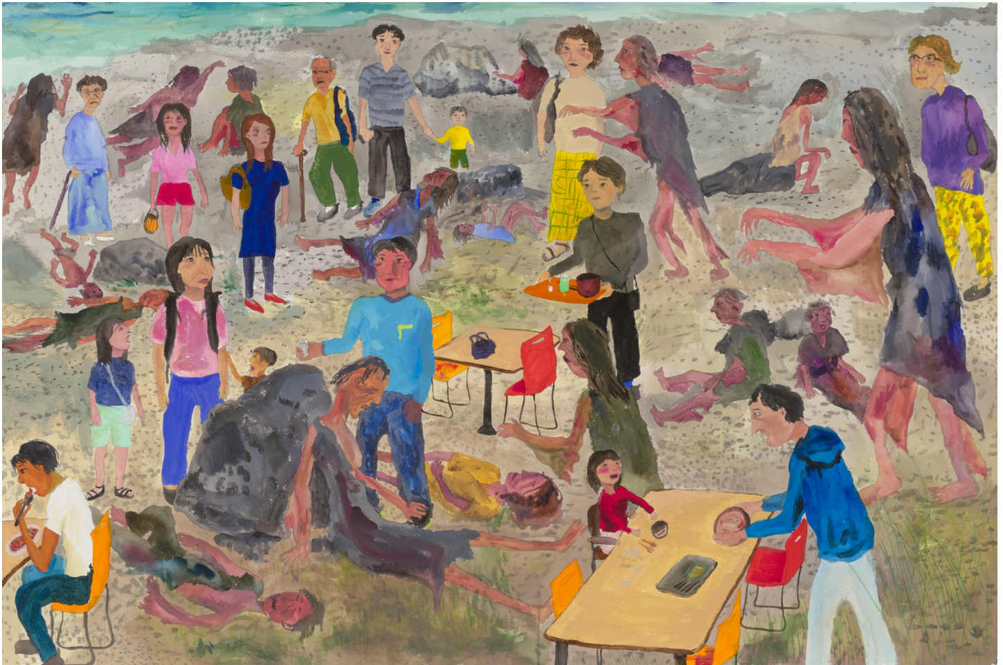
KYOKO IDETSU, SEAT, 2022, acrylic on paper, 101.60 × 152.40 cm.

illustrates these endeavors as experienced across multiple generations—the pandemonium of potty training, the care of sick relatives, and the burial of one’s family members—in addition to other quotidian moments that relate us to one another universally and across time.