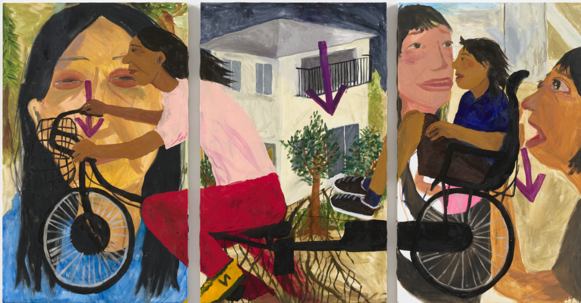
KYOKO IDETSU, Job relocation , 2022, oil on canvas, 129.86 × 240.03 cm.

with immediacy. Idetsu's handling of paint seems fast and loose—quick brushstrokes define recognizable patterns and bodies, and judicious lines create wide-ranging facial expressions that register frustration, weariness, and joy. Moments are tiled upon each other in quick succession: in Man's Quest (2022), Idetsu pictures a man drinking as he recommends a novelist's essay on world fishing travelogues—his doubling head captured in motion—and two large silvery fishes poke their heads into the composition from the right. In Park Security (2022), the silhouette of a dark crow is placed front and center, layered above the profiles of two shouting mothers who are trying to shoo the scavenging birds away.