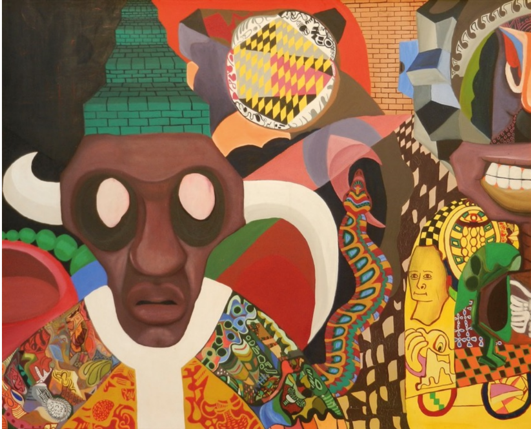
ROScoe MITCHELL, THE THIRD DECADE, 1970, ACRYLIC ON CANVAS, FABRIC, WOOD AND FRINGE, 60 X 101 CM.