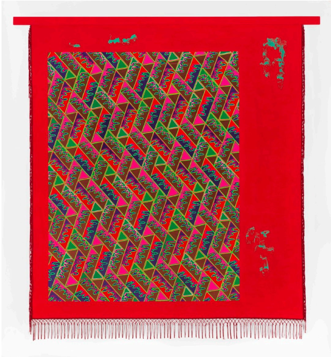
Lisa Alvarado, Traditional Object 29 , 2018, acrylic, fabric and wood, 2.4 × 2.4 m. Courtesy: the artist and LC Queisser, Tbilisi; photograph: Angus Leanly Brown

vertical brushstrokes – swift flicks of the artist’s wrist – create a freehand pattern behind which a glowing vermillion occasionally peeks through. That same colour features in a small rug of part-dyed pheasant feathers that lies on the floor below. The patterning of the iridescent plumage seems to have provided the blueprint for Alvarado’s paintings, and it returns again in Feather Shadow 12 (2018), a narrow rug of feathers that seem to come from a pheasant’s throat. The beauty of the work derives wholly from these materials, which lend the exhibition a very physical form of seduction. After all, Darwin identified the soft touch of a bird’s plumage as a form of enticement crucial to sexual selection.