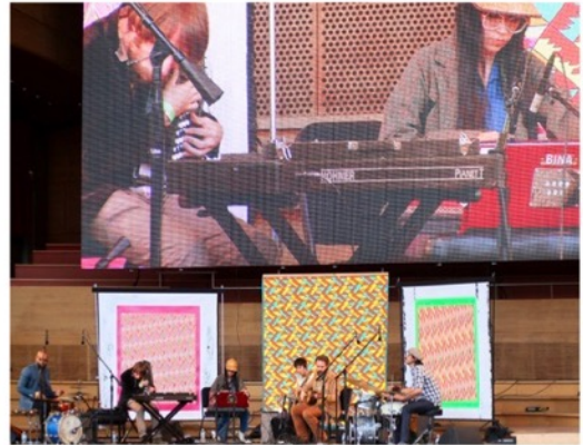
Natural Information Society performing at Pritzker Pavilion, Chicago 2014

Derrick Adams' LIVE and IN COLOR series are laden with signifiers and double entendre that operate as a critique of representation. Through the use of pop-cultural referents, such as sitcoms, infomercials, and television psychics, a conversation emerges between the everyday experience of watching television and its loaded history of imagery, provoking a discourse around consumerism, race and class.