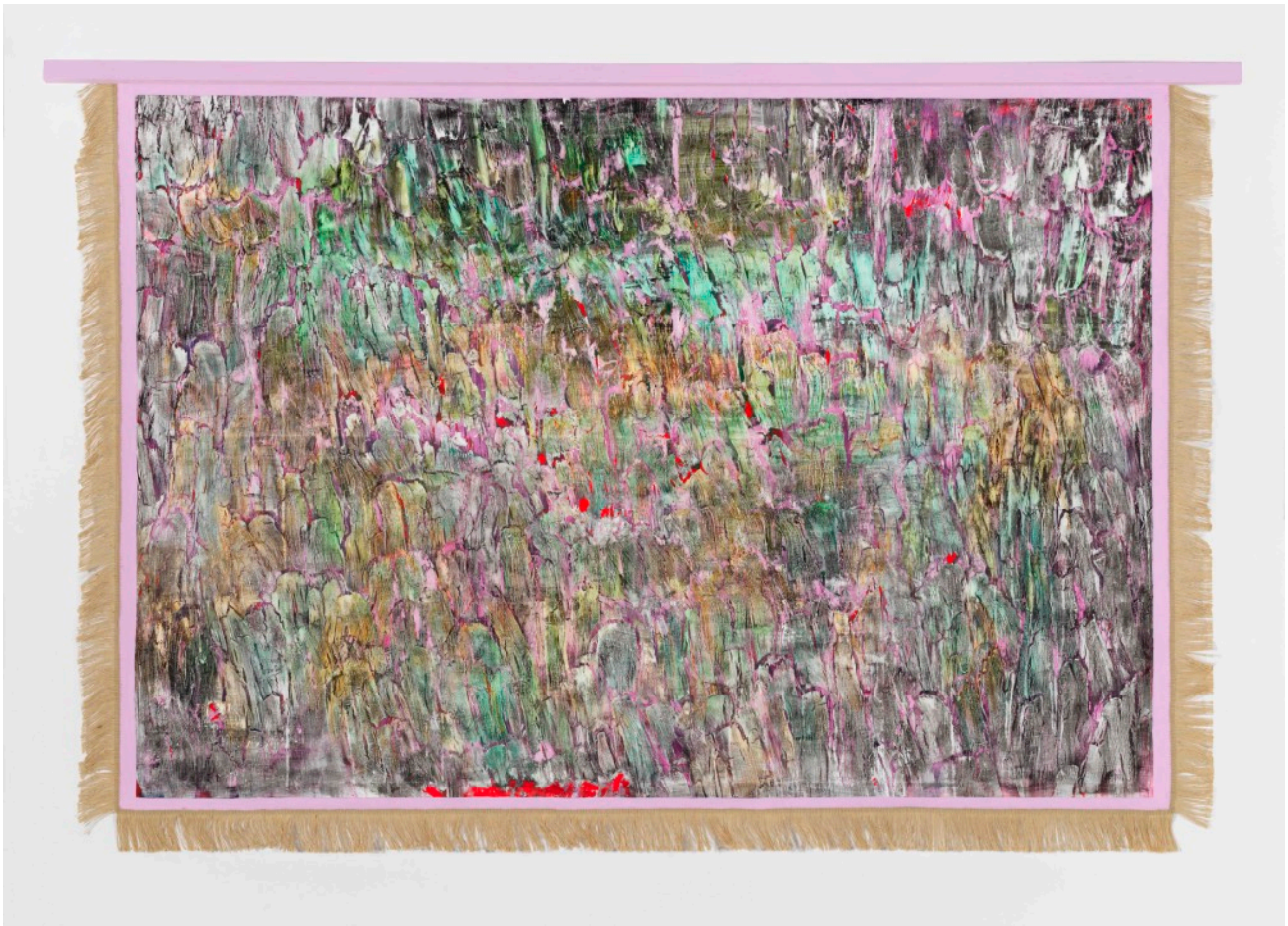
Lisa Alvarado, Traditional Object 28 , 2018, acrylic, fabric, wood, 1.5 × 2.2 m.

This debate surrounding the body's relation to the painted surface returned to me in Lisa Alvarado's exhibition, 'Polyphonic Shadow Cloth', at LC Queisser. Four works, two in large formats, hang from the ceiling as unstretched textiles. Their front-sides are fabric planes painted edge-to-edge; their reverse-sides are a lime green organza. In three cases, an extra layer of material sits between the two, lending the works a soft volume. With the pictures suspended, narrowing the gallery space as architectural interventions, the viewer is pushed to relate to them on both a visual and physical level, an effect only amplified by their soft, delicately knotted borders.