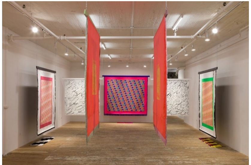
Installation view: Lisa Alvarado, Sound Talisman , Bridget Donahue, New York, March 26 - May 21, 2017.

Often Alvarado delivers what looks like an immaculate modernist composition, only to undo its perfection through material deviations. For Traditional Objects 10, 11, and 12, she encloses an impressionistic sea of thin brush strokes within a rectangle, which itself is set in a larger plane of color. In Traditional Object 11, other substances such as paper towel are buried beneath layers of neon yellow acrylic; the piece’s primary subject (the Impressionist rectangle) is revealed to be a facade covering up techniques and materials native to textile arts or collage.