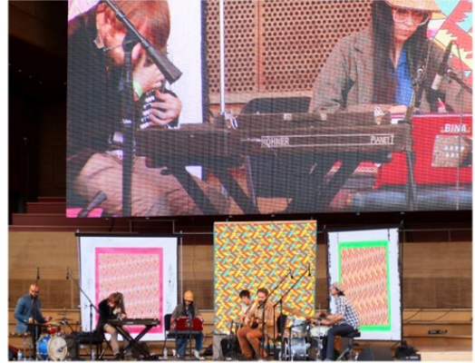
Natural Information Society performing at Pritzker Pavilion, Chicago 2014

Derrick Adams' LIVE and IN COLOR series are laden with signifiers and double entendre that operate as a critique of representation. Through the use of pop-cultural referents, such as sitcoms, infomercials, and television psychics, a conversation emerges between the everyday experience of watching television and its loaded history of imagery, provoking a discourse around consumerism, race and class.