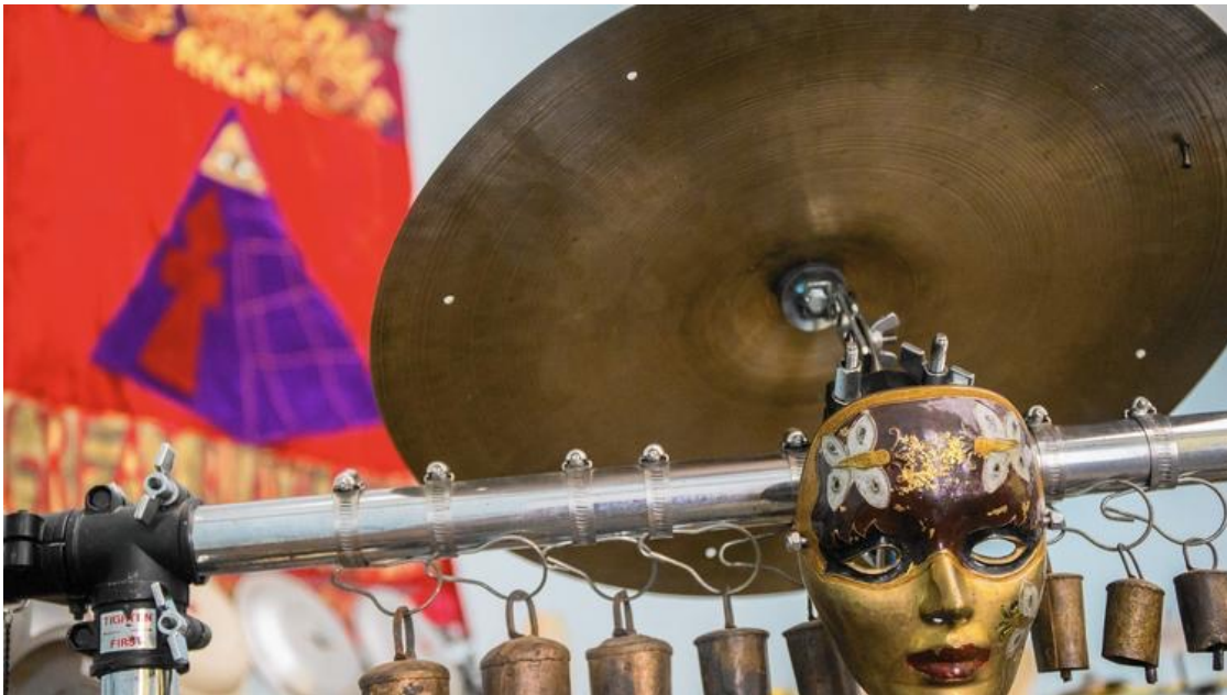
Artifacts and instruments from Roscoe Mitchell, founder of the Art Ensemble of Chicago and an early member of the Association for the Advancement of Creative Musicians, are part of "The Freedom Principle" exhibit at the Museum of Contemporary Art.

Follow that beat, drummer. It's a vital one, and it sounds different in each venue. At the MCA, an institutional obligation to the present tense equals an exhibition pulsing with intergenerational reverberations. Sounds aren't all that cross from one gallery to another; people and ideas move too. Roscoe Mitchell, founder of the Art Ensemble of Chicago and first-generation member of the AACM, features in the center of Rashid Johnson's 2014 wall sculpture, a quartet of splattered shelves artfully arranged with a houseplant, dishes of shea butter, a pair of books and a 1966 album by the Roscoe Mitchell Sextet.