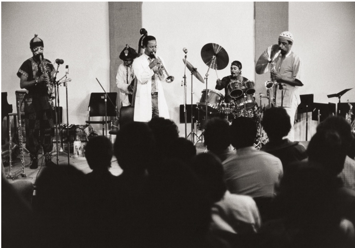
ART ENSEMBLE OF CHICAGO PERFORMANCE AT MCA CHICAGO, 1979

'The Freedom Principle' also featured more conventional black-box screening rooms for works by both the Canadian artist Stan Douglas and Britain's Otolith Group. Both mine film archives to recuperate lost moments. In Douglas's Hors-champs (1992), members of the aacm perform Albert Ayler's free jazz album Spirits Rejoice (1965) on a Parisian TV soundstage. For People To Be Resembling (2012), The Otolith Group created a portrait of the 'post-free-jazz' trio Codono, pulling in a range of references to the political context of the 1970s. Douglas's 2014 installation at David Zwirner Gallery in New York, Luanda-Kinshasa , nodded to the postcolonial vectors of disco, funk and psychedelic music. The looped video shows the improvised performance of a fictional band from the 1970s, playing a loose, vibrant jam session at the famed Columbia 30th Street Studio in New York. This is anachronistic fantasia, to be sure, but to witness the film is to be transported: for a moment, the tumult and jouissance of an otherwise-distant era finds expression in the here and now.